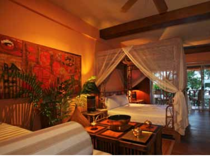
(top) Al fresco dining at the villa. (left) The living room. (above) The Filipino room. (opposite page) A breathtaking view from the villa. (bottom right) An outdoor sitting area in the villa.

An impressive sight welcomes travelers approaching Puerto Galera from the sea, with its verdant mountains overlooking its scenic bay, which is considered one of the most beautiful bays in the world. You can just imagine how it must look from the air. Which is exactly how Gerry Lane first saw it.